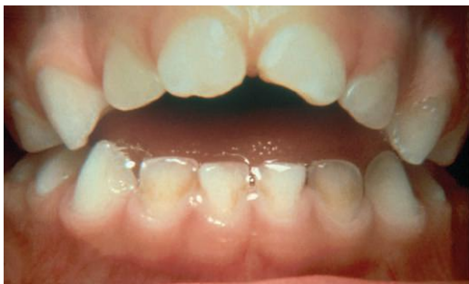
Result of a prolonged sucking habit

Most children stop sucking on thumbs, pacifiers or other objects on their own between 2 and 4 years of age. However, some children continue these habits over long periods of time. In these children, the upper front teeth may tip toward the lip or not come in properly. Frequent or intense habits over a prolonged period of time can affect the way the child's teeth bite together, as well as the growth of the jaws and bones that support the teeth.